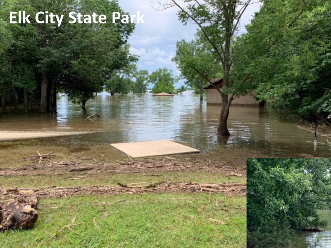
Elk City State Park