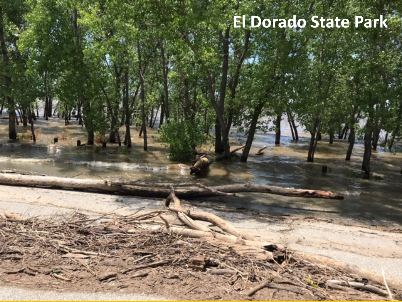
El Dorado State Park