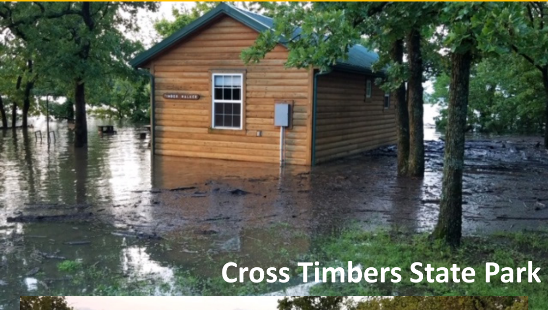
Cross Timbers State Park