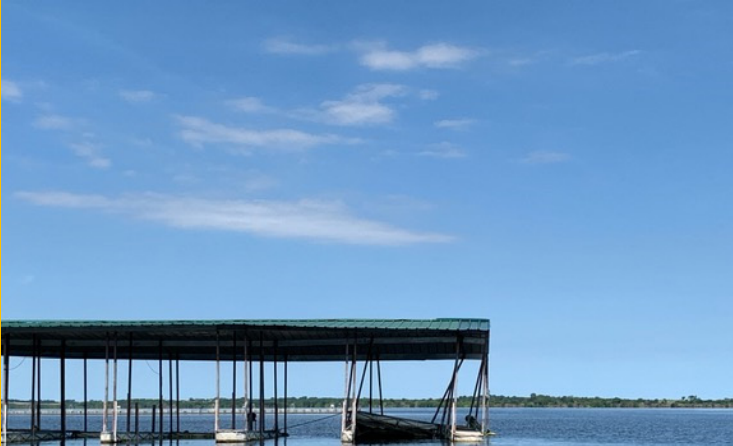
Milford State Park