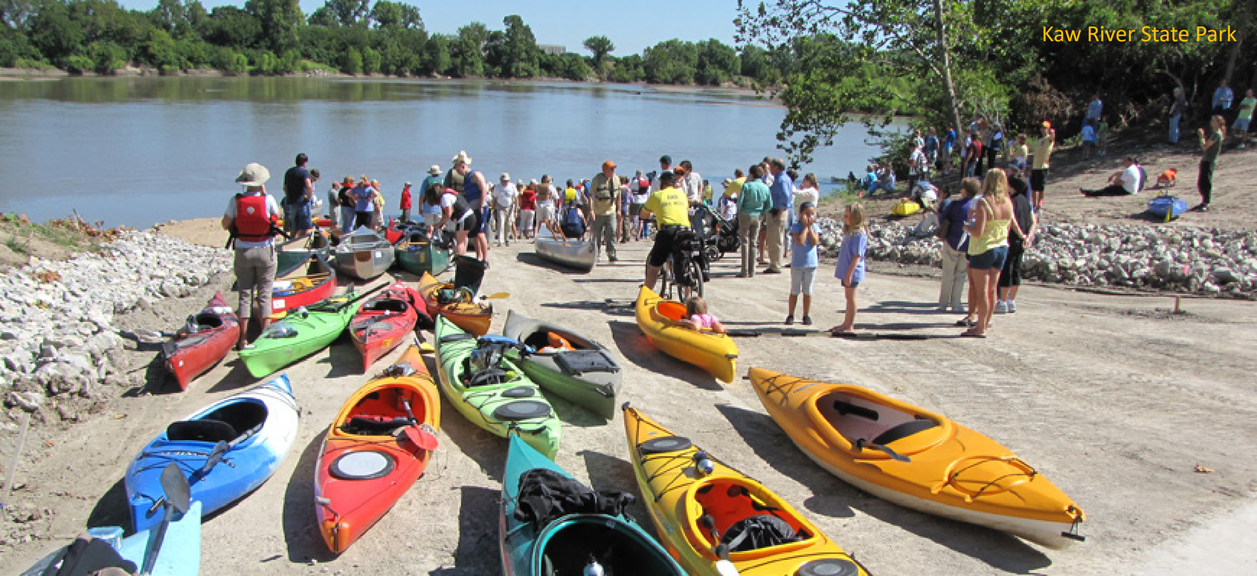
Kaw River State Park