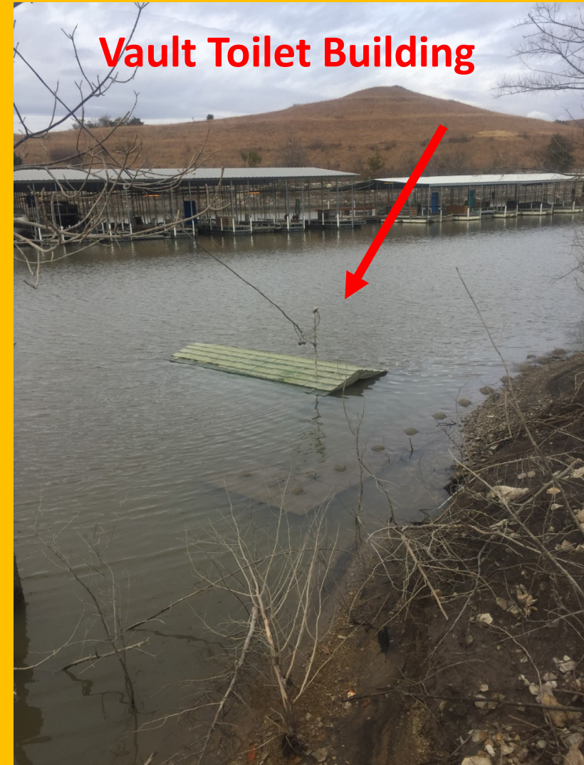
Flood Control/Water Supply