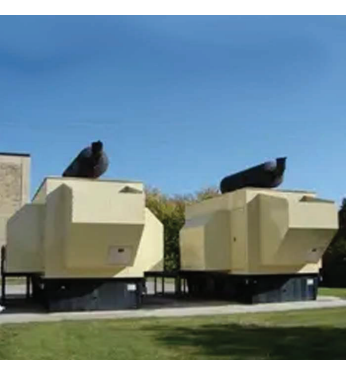
Akers Energy Center Generator Replacement

Re-purpose vacated space for campus growth after the departure of the department of Art and Design. Construction commenced September 2020 and will complete December 2021.