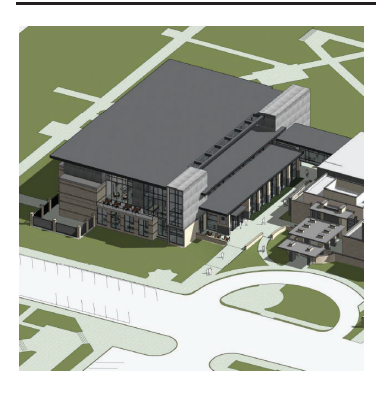
Center for Student Success Private Funds / Student Fees

Construction document work is nearing completion. Construction began spring of 2020 and will conclude June 2021.