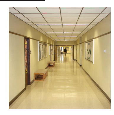
Rarick Hall Renovation University and R&R Funding

Construction document work is nearing completion. Construction began spring of 2020 and will conclude June 2021.