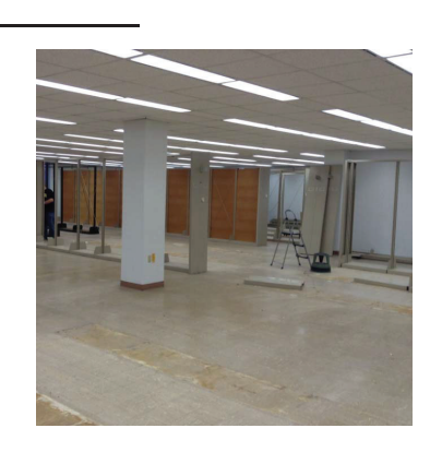
Forsyth Library Renovation University Funds & R&R Funding

The removal of the 900 stall asphalt parking lot to be replaced and expanded with concrete.