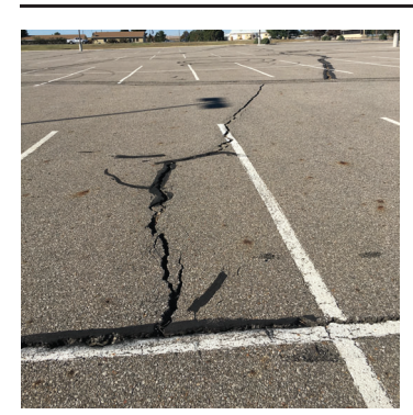
Gross Memorial Coliseum Parking Replacement University and Parking Funding

The removal of the 900 stall asphalt parking lot to be replaced and expanded with concrete.