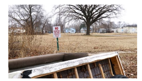
Bulldozed, trash-littered, vacant lots created by the city's policy are a blighting influence on the neighborhood