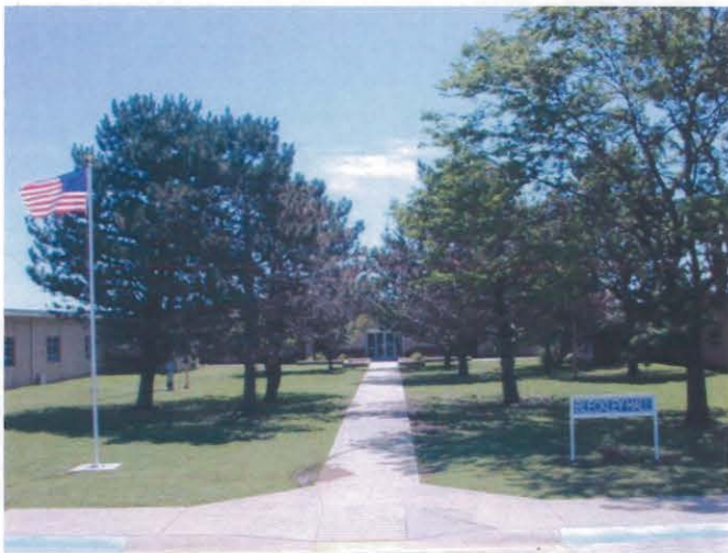
Bleckley Hall (long-term Care and Special Care)