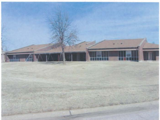
Donlon Hall (Assisted Living)