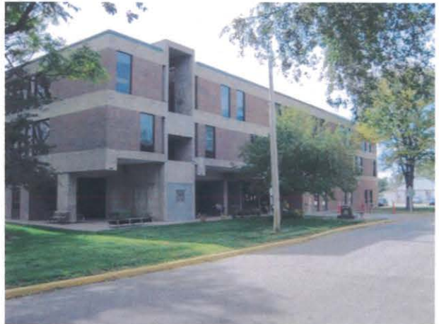
Halsey Hall (Long-term Care)