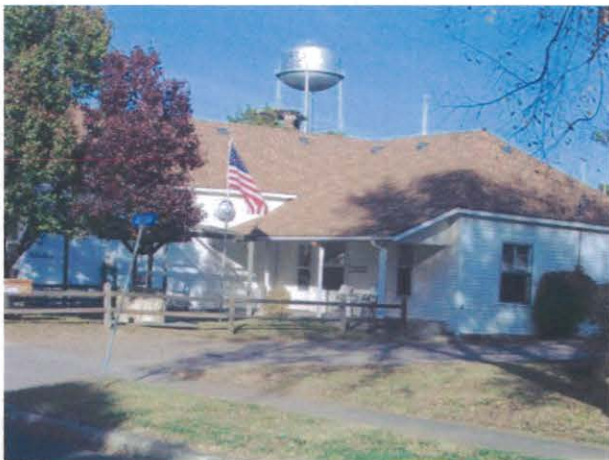
The Sutlers Store (Visitor Center)