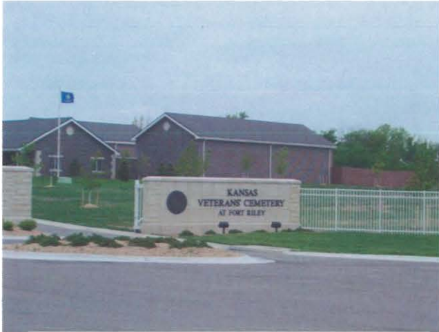
Kansas Veterans' Cemetery at Fort Riley (opened in 2009)

Spouse, surviving spouse, and dependent children are eligible for interment, even if the veteran is not buried in a Kansas State Veterans' Cemetery. The veteran must have met military service requirements. This includes lost or buried at sea, missing or missing in action, or a veteran whose remains have been donated to science or cremated and the ashes scattered.