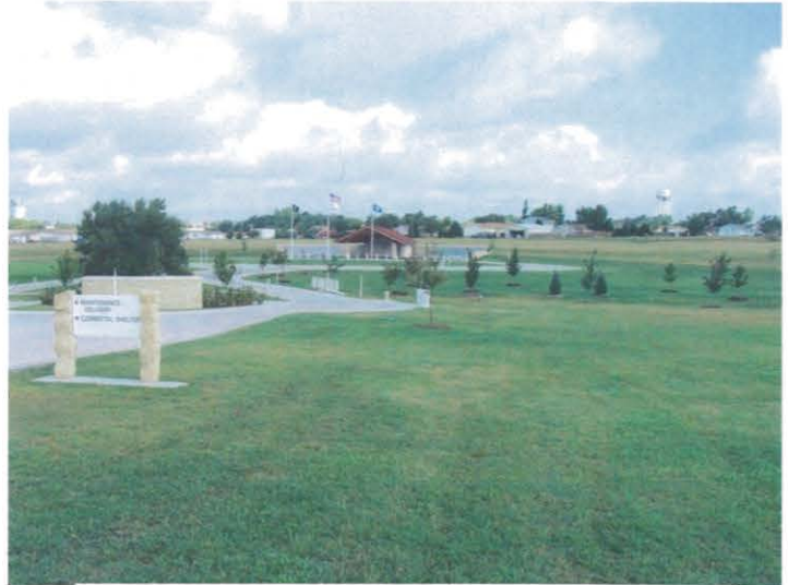
Kansas Veterans' Cemetery at WaKeeney (opened in 2004)