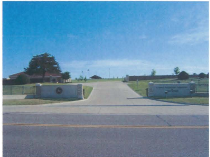
Kansas Veterans' Cemetery at Fort Dodge (opened in 2002)

The construction of these cemeteries was funded 100% by federal grants from the Department of Veterans Affairs National Cemetery Administration, State Cemetery Grants Programs.