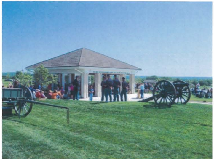
Kansas Veterans' Cemetery at Fort Riley