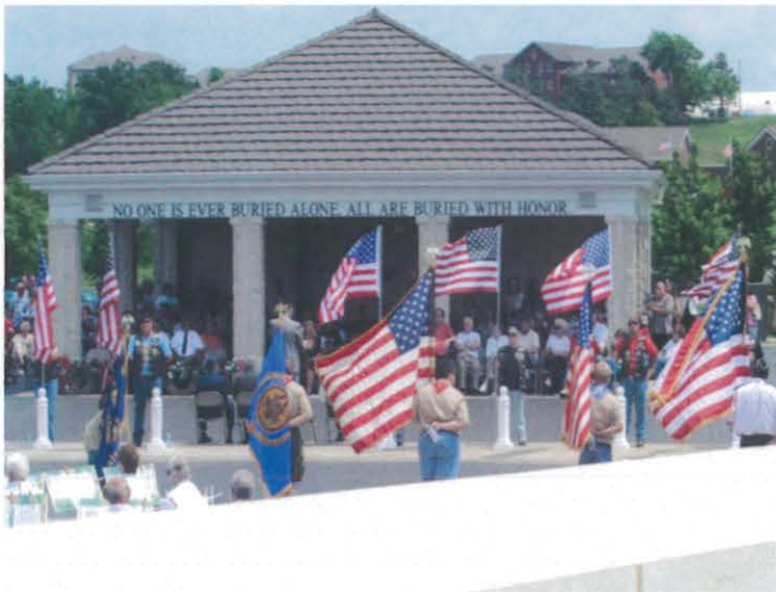
Kansas Veterans' Cemetery at Winfield (opened in 2004)

The VA National Cemetery Administration conducted a Triennial review of all four State Veterans Cemeteries during the week of July 9 -13, 2012. All four cemeteries passed the Triennial review and received the "Excellence of Appearance Award".