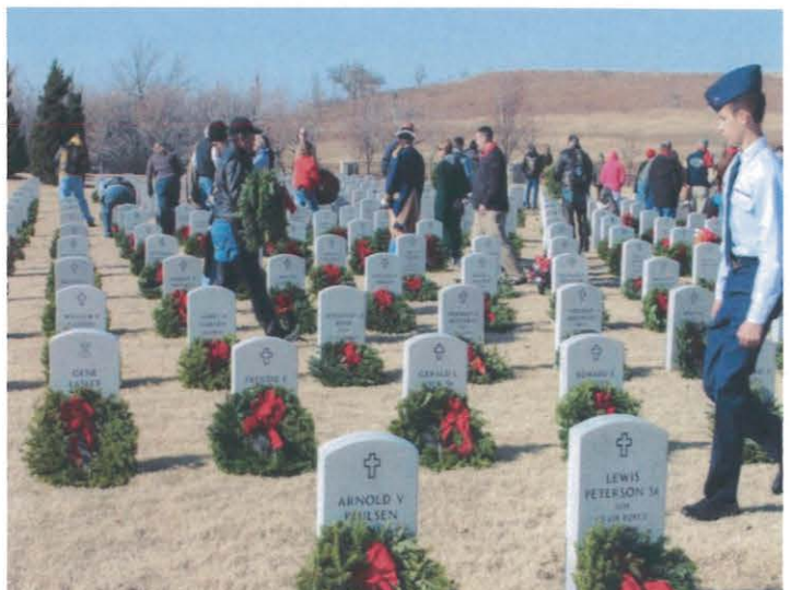
Wreaths Across America (Kansas Veterans Cemetery at Winfield)