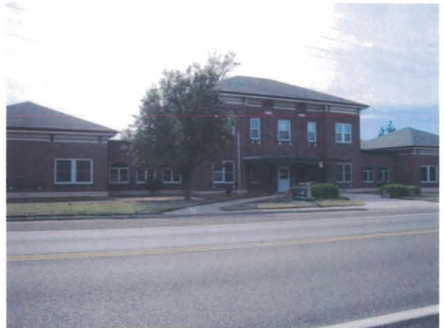
Lincoln Hall (Domiciliary)