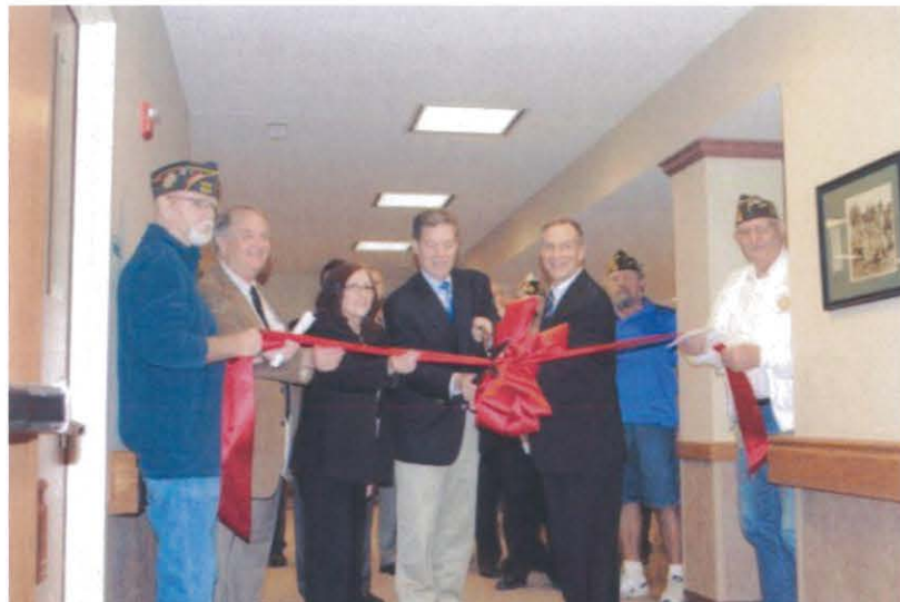
Ribbon cutting ceremony for Triplett Hall

On October 16th, 2014, the Kansas Veteran' Home had the ribbon cutting ceremony for the grand opening of Triplett Hall. This expansion of resident services will allow the Home to care for a total of 142 residents in nursing care and 48 in assisted living care.