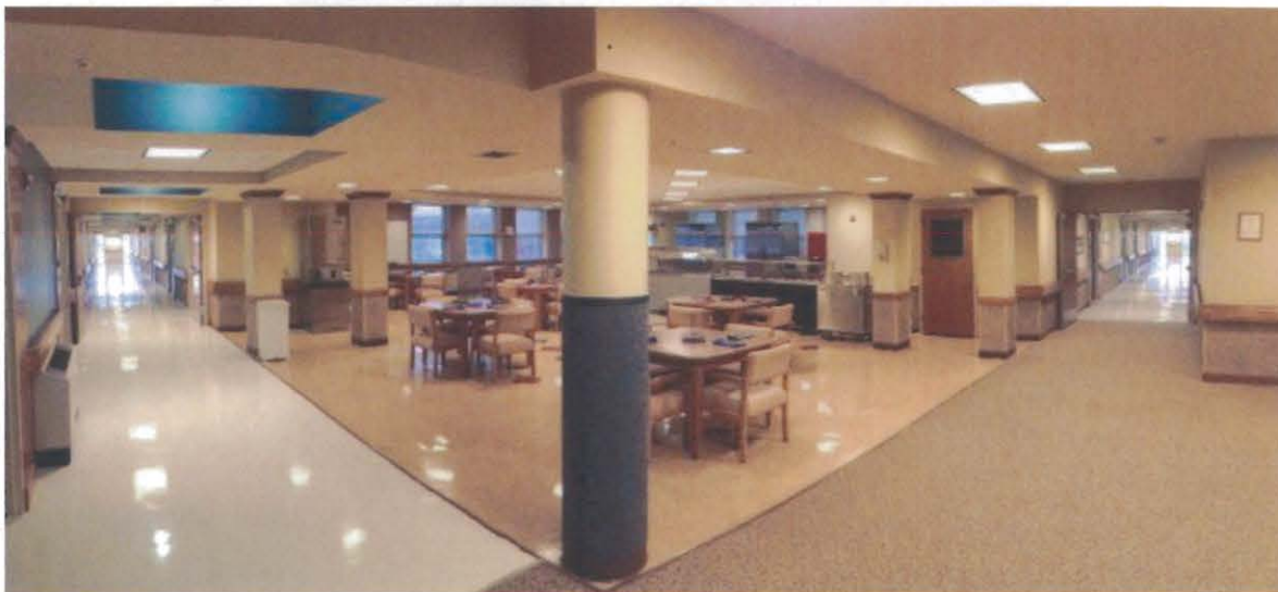
Inside Triplett Hall