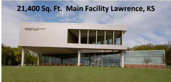
21,400 Sq. Ft. Main Facility Lawrence, KS