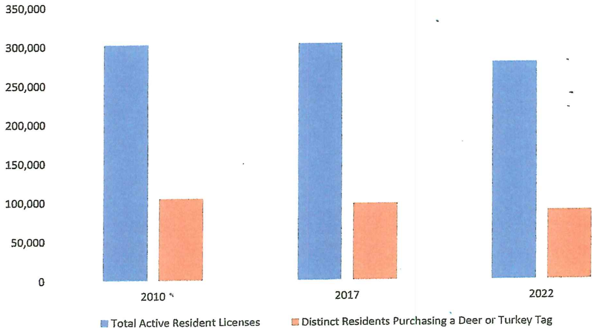
Active Resident Hunting Licenses and Tag Purchases, by Year